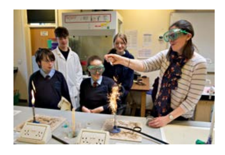
"Staff are welcoming, friendly and supportive."

"Staff show so much support and patience."